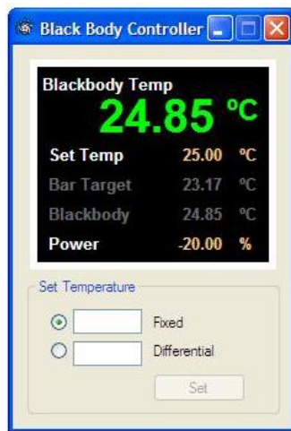
Fixed Mode Display

Differential mode is used with the bar target in place so that the blackbody radiator plate maintains a fixed temperature difference relative to the target.