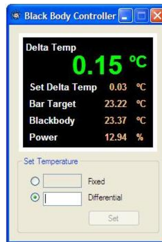
Differential Mode Display